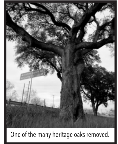
One of the many heritage oaks removed.